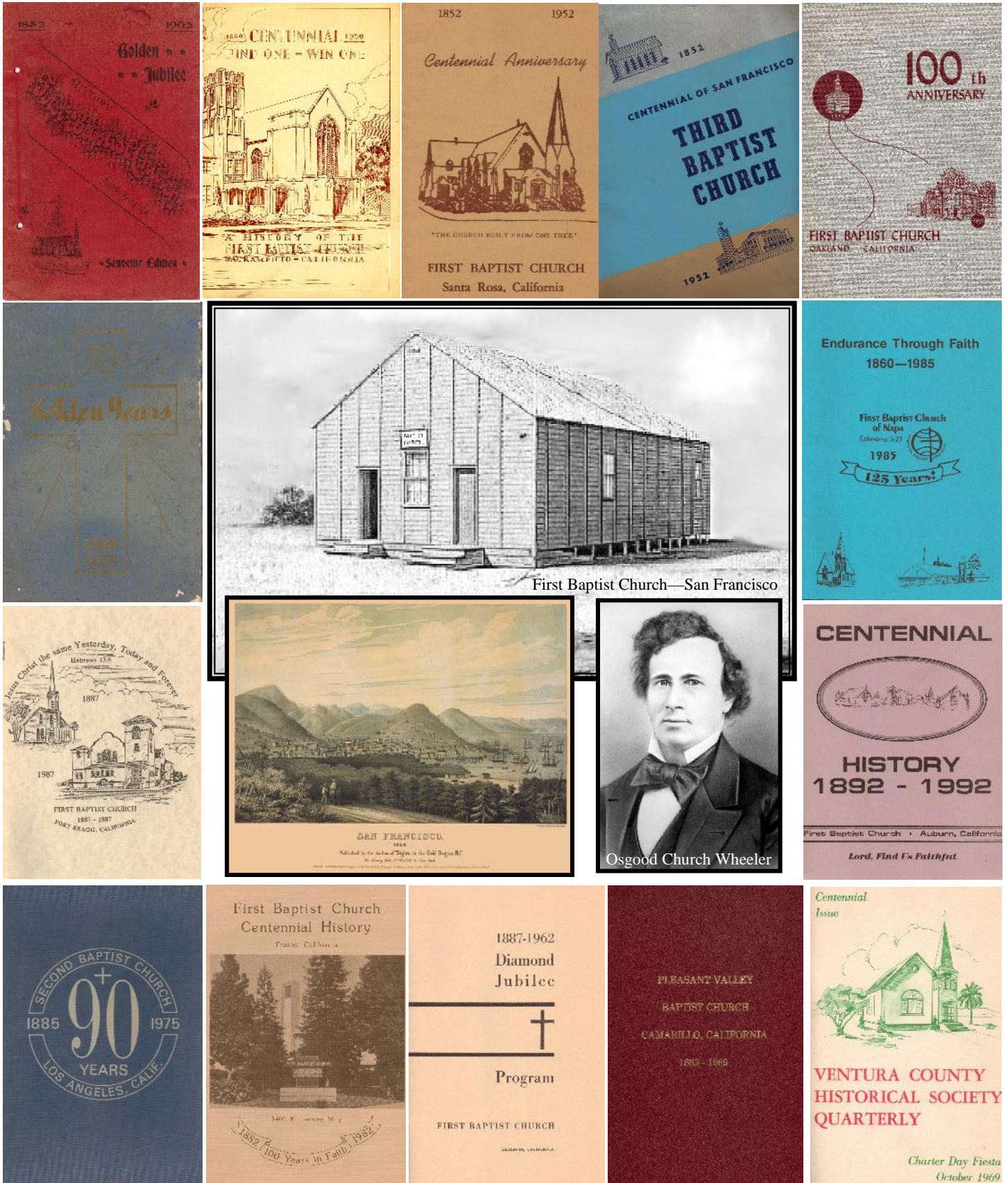
Representing a collection of Booklets available throughout California.