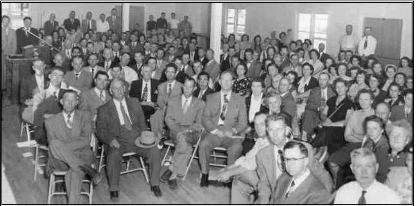
The Cooperative Association of Missionary Baptist Churches of California Third Session, March 31 & April 1, 1953 Held with the First Missionary Baptist Church—Ceres, California